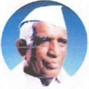
Founder President, Council of Education, Kolhapur